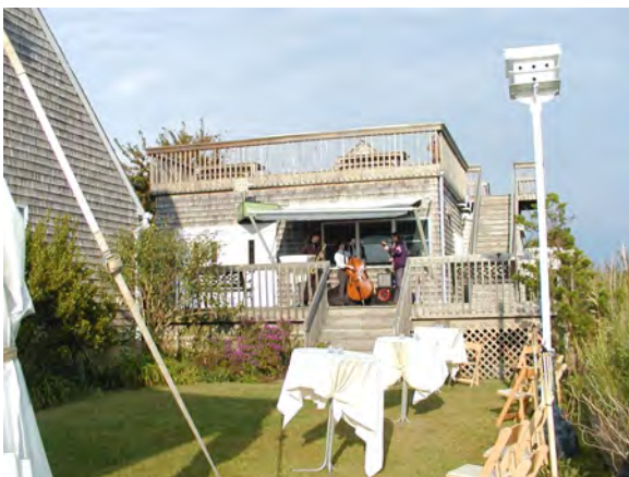
Terrapin Station Deck with Observation Deck above