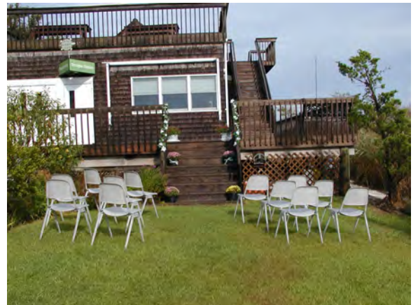
Terrapin Station Deck with Observation Deck above