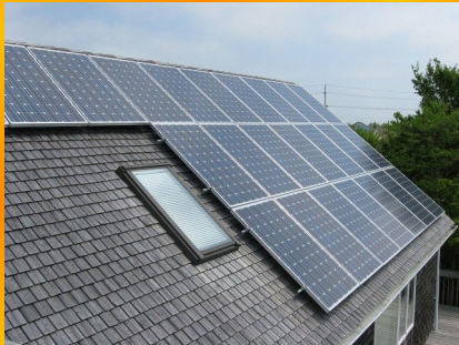
Solar Panels of Diller roof Project #1

The Wetlands Institute has undergone two solar energy projects since 2010.