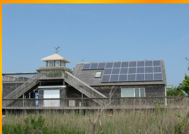
View of Wetlands Institute from South Side (Salt Marsh Trail)

The Wetlands Institute is developing educational material, programs and enhanced displays to promote renewable energy use. At the completion of Project #1, a kiosk was installed to allow visitors to learn about the energy saved each day based on the weather. Moving forward, this kiosk will move to a flat panel display that streams a number of environmental data sets including solar performance, weather, tides and water quality data.