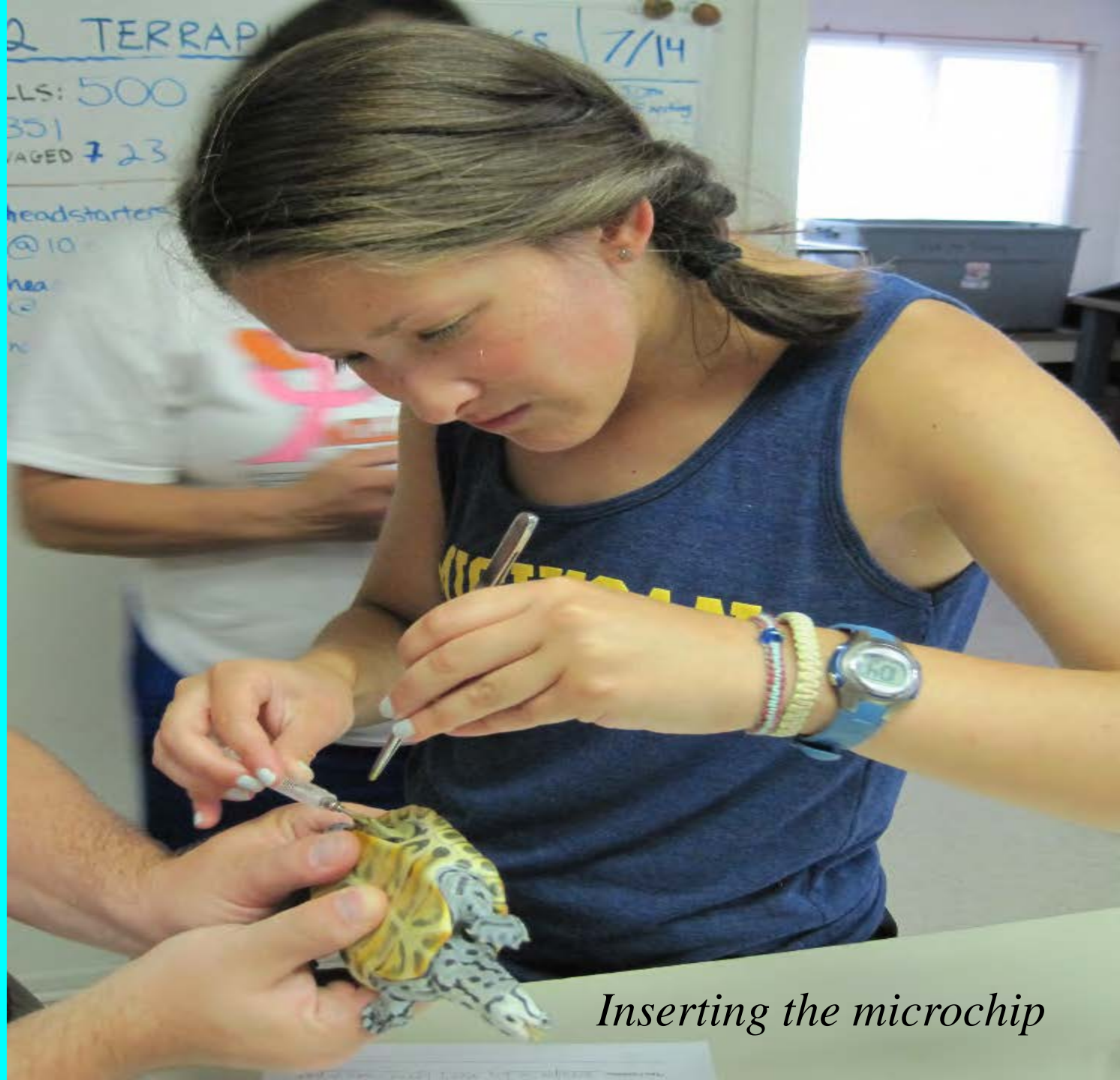
Inserting the microchip