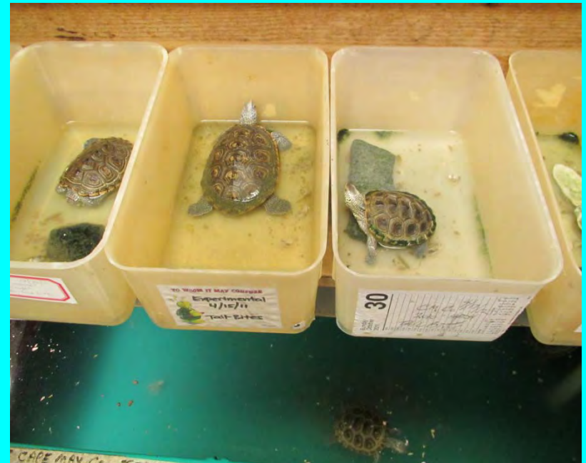
Stockton Turtle Farm