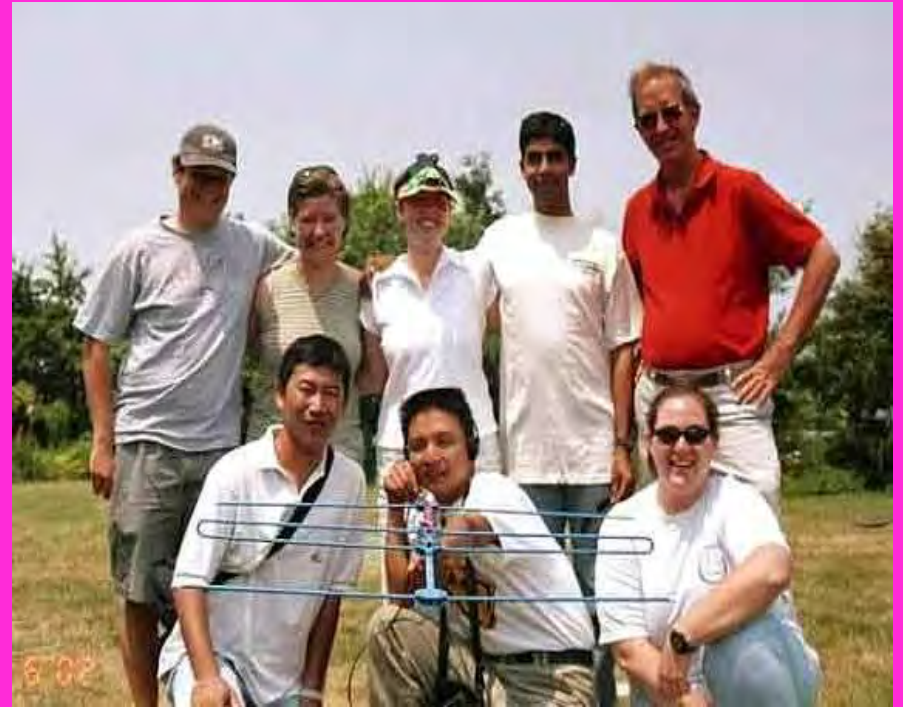
The original sonic tracking team