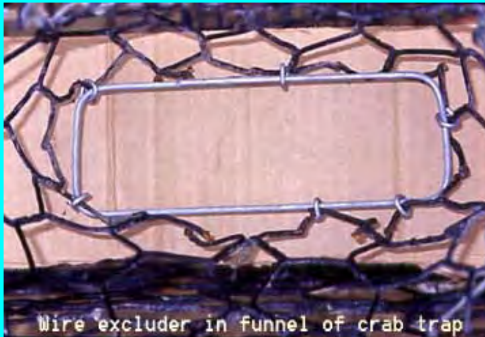
Wire excluder in funnel of crab trap