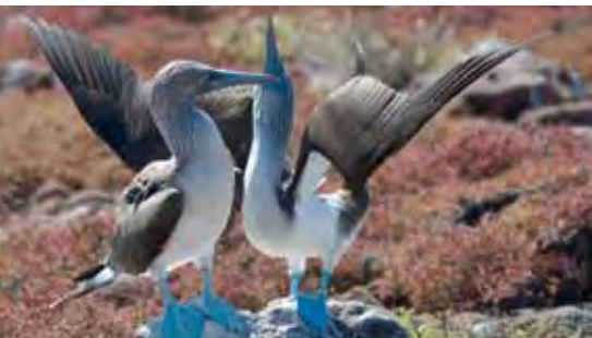
Blue-footed Boobies enjoying the ocean breeze

The days and nights in Galapagos Islands are equal in length, so you'll have plenty of chances to see the diurnal and nocturnal animals. There is no need for daylight savings because of its proximity to the equator. All year round there will be about 12 hours of daylight.