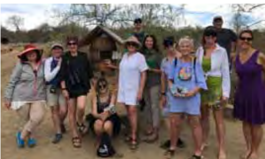
Travelers mailing their postcards at Post Office Bay

"The natural history of this archipelago is very remarkable: it seems to be a little world within itself; the greater number of its inhabitants, both vegetable and animal, being found nowhere else."