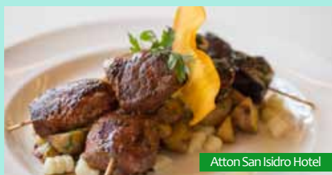
Atton San Isidro Hotel