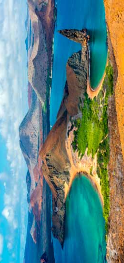
Classic Escapes protects our planet. ♻️

The Wetlands Institute 1075 Stone Harbor Blvd Stone Harbor, NJ 08247