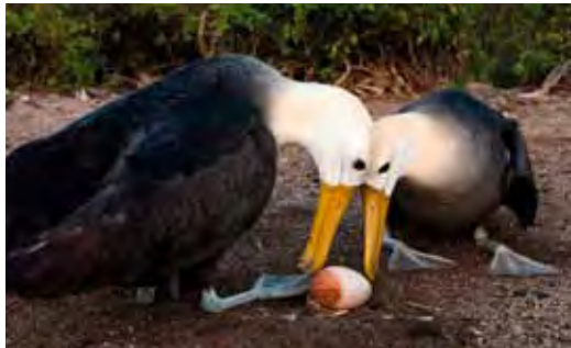
A pair of Albatross birds tending to their unborn baby

Spend your final morning on a panga ride through an extensive tidal lagoon system that stretches almost a mile inland. While aboard, you will spot turtles, herons, and several species of sharks and rays. Return to the Baltra airport for your flight to Guayquil. A dayoom is provided at the ORO VERDO hotel. Enjoy a farwell dinner at El Patio Restaurant, before being transferred back to the airport for your flight back home, arriving the next day.