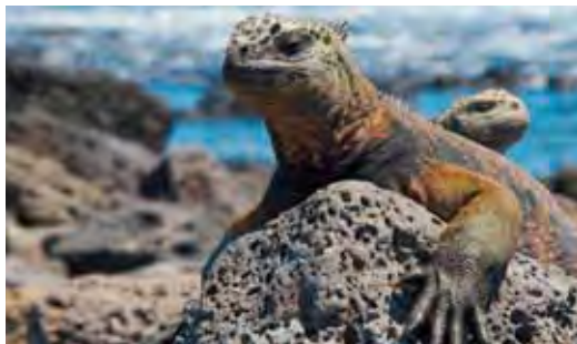
The Endemic Marine Iguana wearing his sea salt wig