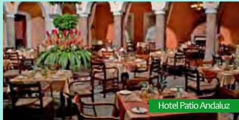
Hotel Patio Andaluz