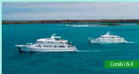
Corals I & II