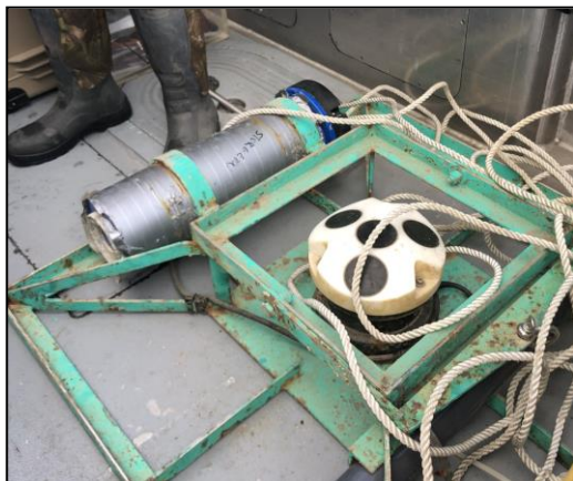
Top Left: ISCO water sampler platform sampling water flows in a tidal creek. Top Middle: Performing nest checks on Sturgeon Island. Top Right: Great Egret chicks at Sturgeon Island. Bottom: Bottom-Mounted Acoustic Wave and Current Sampler prior to deployment in SMILL system.