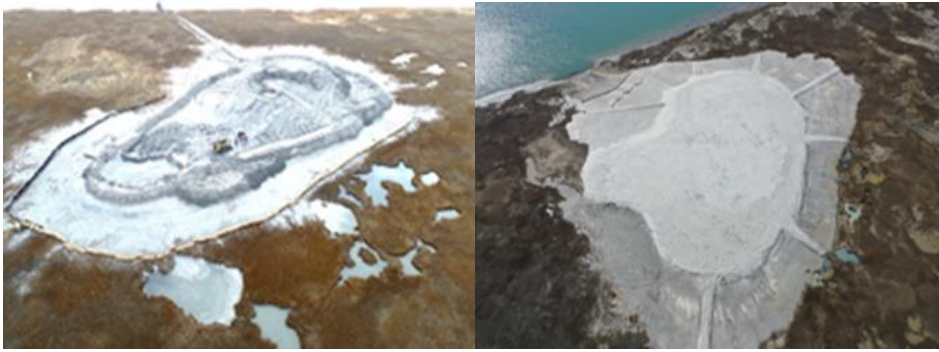
Figure 2. Sandy elevated nesting habitat at Great Flats during initial construction in 2018 (left) with placement resulting in 0.9 to 1.2m of elevation gain on the habitat area and 3-12cm of thin layer accumulation on the surrounding marsh plain. Adaptive management in 2021 (right) reestablished target elevations and early successional conditions.

Cohesive sediment-based projects focused on marsh elevation enhancement, marsh edge protection and intertidal shallows creation and enrichment. Gull Island and Sturgeon Island are low lying, marsh islands at risk of drowning. At each island, a suite of projects was constructed to address different ecological goals and trial new approaches (Figures 3 and 4). Projects focused on marsh elevation enhancement were minimally contained or uncontained and utilized natural elevations, pipe end positioning to maximize flow pathways, and tidal channel networks to spread material and build elevation capital. Marsh edge protection features and intertidal and subtidal shallows were constructed or enhanced using a floating pontoon for subtidal or indirect placement via tidal channels. Marsh edge protection berms resulted in 0.3 to 0.8 m of elevation gain up to the marsh edge and retained 50% of the volume 16 months post placement (Perkey et al. 2022). Initial measurements are documenting wave attenuation from the feature. Fall et al. (2022) documented low turbidity during placement that was short lived and very close to background levels for the system. Reine (2022) documented rapid recovery of benthic communities associated with the marsh edge protection berm and enhancement of intertidal and subtidal shallows.