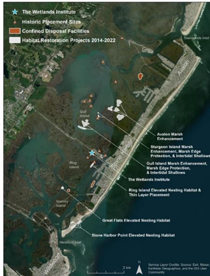
Figure 1. Map of BUDM projects in SMIIL. Summarized in detail in Table 1.

The SMIIL concept brings technical and social domains together in a collaborative forum that advances science, practice, and innovation for the region. Through key partnerships, monitoring, design, construction and adaptive management, SMIIL efforts evolved to a new level with follow-on projects that used both sand and cohesive channel sediments to build and trial new nature-based solutions. Tedesco et al. (2021) provides a summary of projects including the initial pilots at Avalon and Ring Island and the follow-on projects at Great Flats, Sturgeon and Gull Islands (Figure 1 and Table 1).