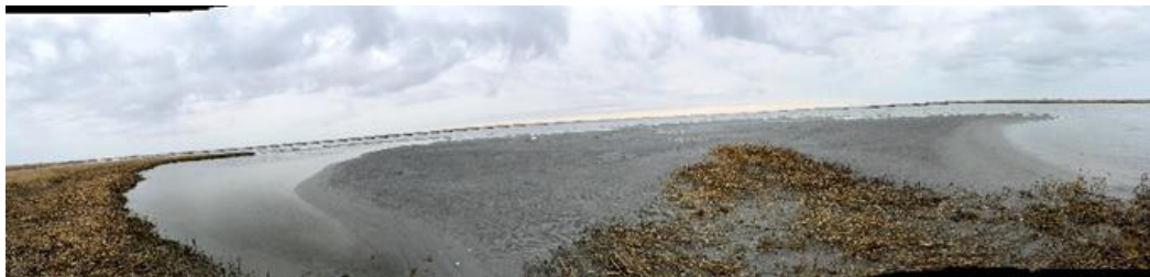
Figure 6. Strategic placement of sandy materials to build marsh edge protection feature at Sturgeon Island (top photo) and sediment welded to marsh edge and nourishing marsh with sediment 3 months post-placement (bottom).

Ongoing monitoring of the projects includes physical and geotechnical studies (elevation evolution, compaction, and dewatering; sediment transport and erosion; wave attenuation and turbidity generation {Fall et al. 2021; Fall et al. 2022}); hydrology and ecological studies (vegetation evolution, benthic community response {Reine 2022}), focal avian species response (Collins et al. 2021) and social science aspects involving communities (Thorne et al. 2022). Over 30 researchers from USACE, the State of NJ and various academic institutions are currently working on data collection and analyses for SMIIIL projects and related practices. Future publications from ongoing research efforts will continue to share knowledge and encourage collaboration within SMIIIL as well as regionally, nationally and internationally.