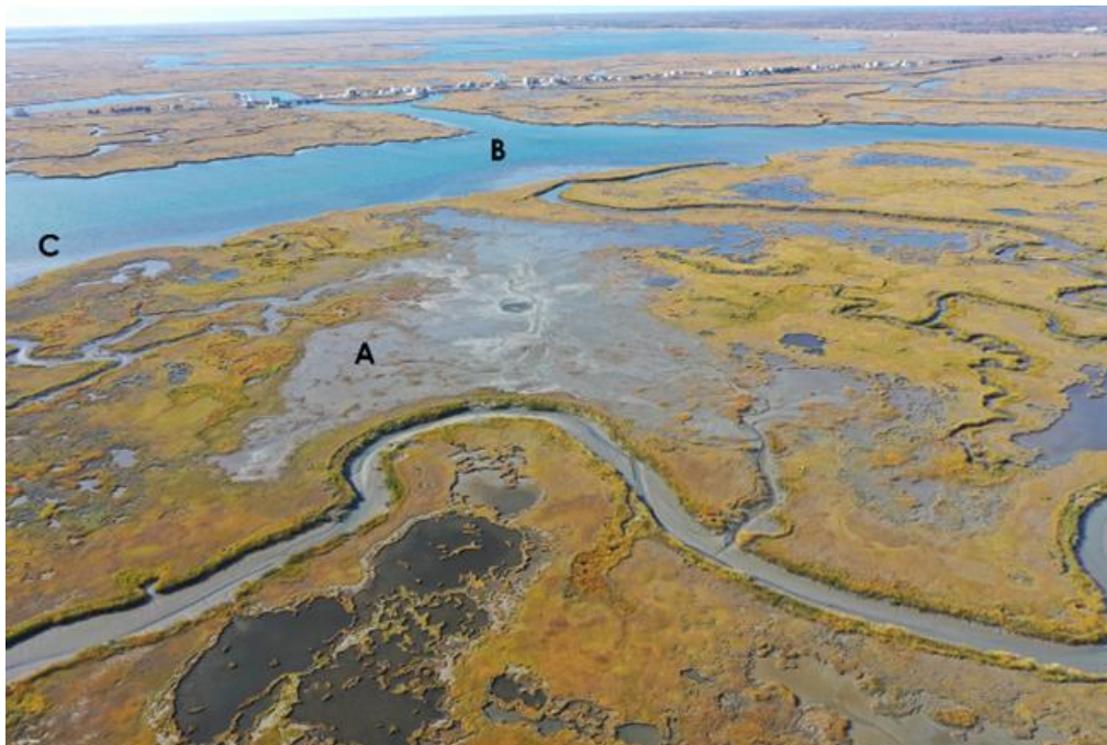
Figure 3. Constructed marsh restoration (A), marsh edge protection (B), and intertidal shallows enhancement (C) with fine sand and mud at Gull Island.

Cohesive sediment-based projects focused on marsh elevation enhancement, marsh edge protection and intertidal shallows creation and enrichment. Gull Island and Sturgeon Island are low lying, marsh islands at risk of drowning. At each island, a suite of projects was constructed to address different ecological goals and trial new approaches (Figures 3 and 4). Projects focused on marsh elevation enhancement were minimally contained or uncontained and utilized natural elevations, pipe end positioning to maximize flow pathways, and tidal channel networks to spread material and build elevation capital. Marsh edge protection features and intertidal and subtidal shallows were constructed or enhanced using a floating pontoon for subtidal or indirect placement via tidal channels. Marsh edge protection berms resulted in 0.3 to 0.8 m of elevation gain up to the marsh edge and retained 50% of the volume 16 months post placement (Perkey et al. 2022). Initial measurements are documenting wave attenuation from the feature. Fall et al. (2022) documented low turbidity during placement that was short lived and very close to background levels for the system. Reine (2022) documented rapid recovery of benthic communities associated with the marsh edge protection berm and enhancement of intertidal and subtidal shallows.