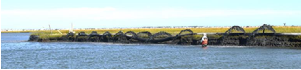
Figure 5. Trialing techniques to build elevation and marsh edge protection with cohesive sediments at Sturgeon Island using a sediment distribution pipe.