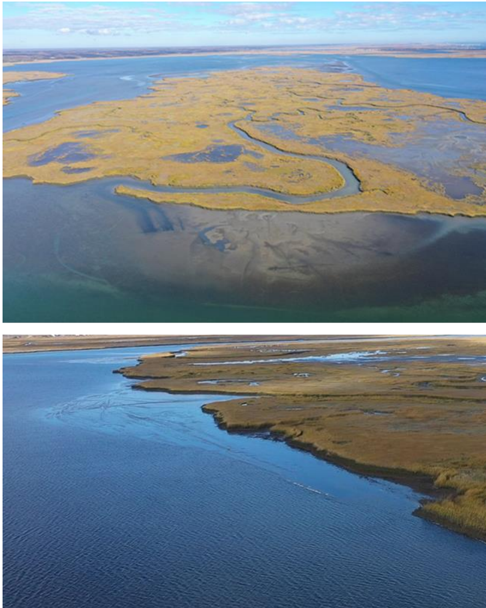
Figure 4. Marsh edge protection berm constructed via subtidal placement; 6,880 cubic meters of material resulted in wave attenuation (top photo) and intertidal and subtidal shallows were enhanced by indirect placement through tidal channels shallowing the bottom up to elevations where macroalgae flourish (bottom).

Innovative techniques including the sediment distribution pipe (Beardsley et al. 2022) were also trialed while working on building elevation on Sturgeon Island and testing marsh edge protection feature creation (Figure. 5). Marsh platforms were uplifted by 0.4 to 0.8m and after 2 years post-placement have stabilized. Vegetation has colonized larger portions of the platforms that were vegetated prior to placement, and vegetation has moved into many areas that were formerly below elevation ranges for Sporobolus alterniflorus . Significant vegetation establishment occurred in the second growing season post-placement predominantly via natural seed bank germination. Additional dredging and placements were completed at Sturgeon Island in the Fall of 2022. These projects used containment in the form of temporary water-filled barriers to build marsh elevation to transitional elevations for wading bird nesting, and through use of a Y-valve and pontoon system also strategically placed sandy sediments to create a sandy marsh edge protection system (Figure 6). Within three months of placement, the sandy marsh edge protection feature welded to the northern portion of the island building a sediment ramp and transporting sediments onto a portion of the marsh nourishing the marsh. Additional placements are planned for the southern portion of SMIL in 2023, via dredging of the NJIWW channel and funded through the Bipartisan Infrastructure Law.